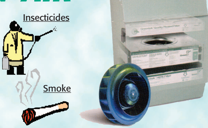
The Greentek Whole House HEPA Filtration System

Here are four important reasons why you should have Clark Electric Appliance & Satellite, Inc., install a Greentek HEPA filtration system in your home: high efficiency and superior quality, ultra-quiet operation, reliability, and easy maintenance. Maintenance is always a question on everyone's mind when it comes to equipment. The pre-filter and carbon filter need to be changed every three to six months, while the HEPA filter needs to